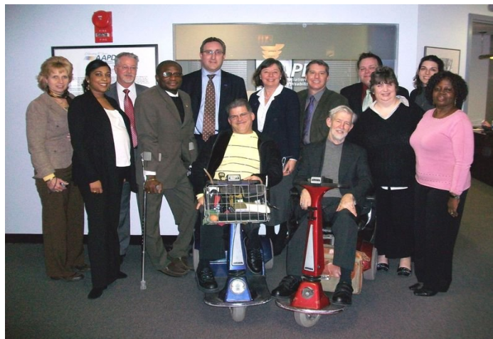
Ghana Delegation at AAPD